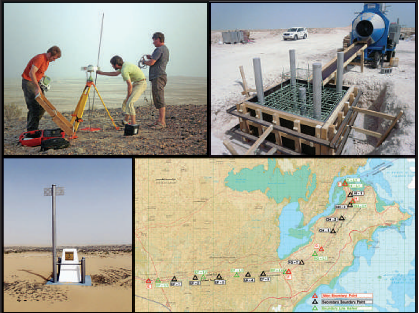
Border work for Saudi Arabia/Qatar – clockwise from top left: Geodetic control survey for the demarcation of borders (IGN FI: 1996/2000 and 2007-2010); construction of a boundary marker (IGN FI: 1996/2000 and 2007-2010); position of the new border markers on the border map (IGN FI: 2010-2011); and intermediary boundary marker (IGN FI: 1996/2000 and 2007-2010)