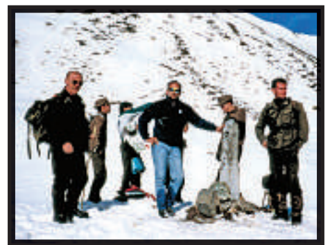
Boundary demarcation between France and Italy

The quality of images must be studied in detail. It is necessary to ensure the availability of images: do images already exist in the archives or will they need to be acquired? If images do exist, is the quality sufficient? If not,