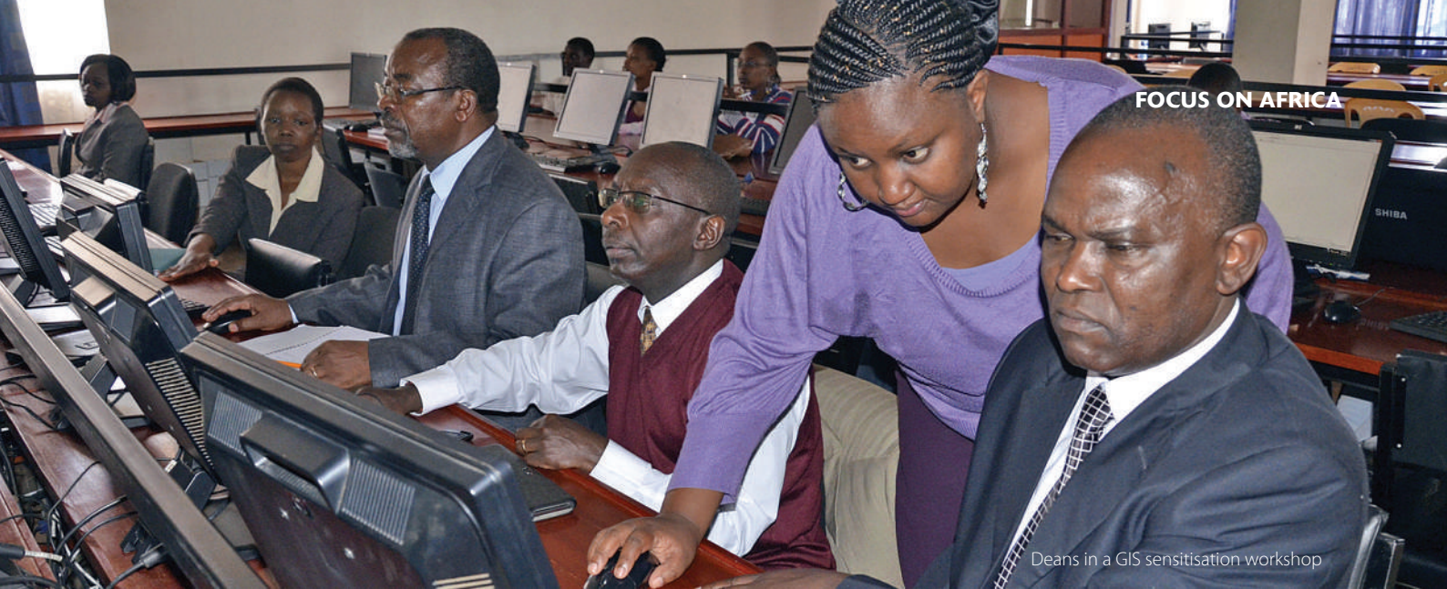
Deans in a GIS sensitisation workshop