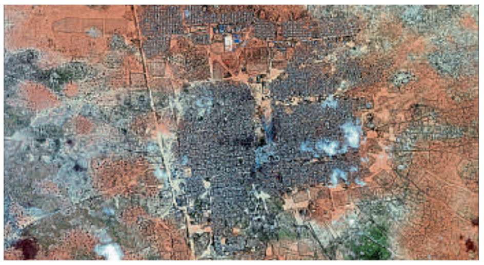
Satellite image of the Dadaab camp in Kenya taken in June 2015, when the camp was home to more than 400,000 Somali refugees.

eCognition uses an approach called object-based image analysis (OBIA) to identify and classify features in an image. According to Dr Dirk Tiede, one of Lang's colleagues at Z_GIS, OBIA offers greater flexibility and